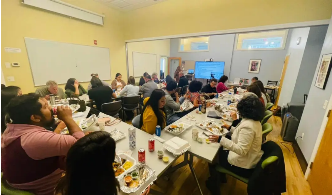
Meeting with PLS, 30th Judicial Alliance, Buncombe County, El Centro, Unidx, Hola Carolina, Bounty and Soul.